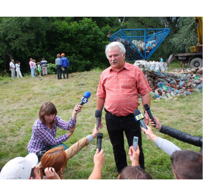
Month Day, Year | City, Country